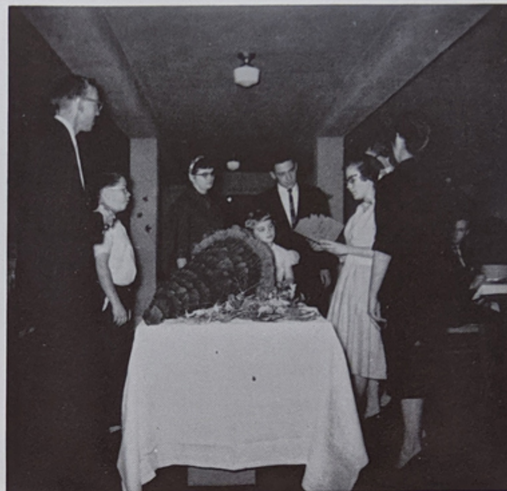
COUNTING OUR BLESSINGS