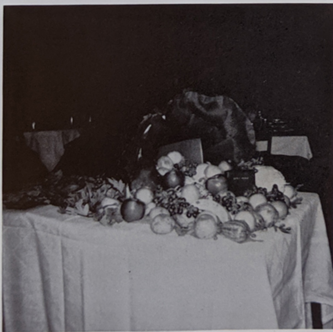
HORN OF PLENTY

Thanksgiving Day is one of both fun and blessing at Vennard. In the morning there is a basketball game. At noon there is a program presented by the Junior class and a wonderful meal with all of the trimmings. The theme this year was "Blessings More Abundant."