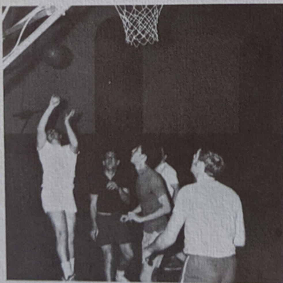
Working up an appetite!