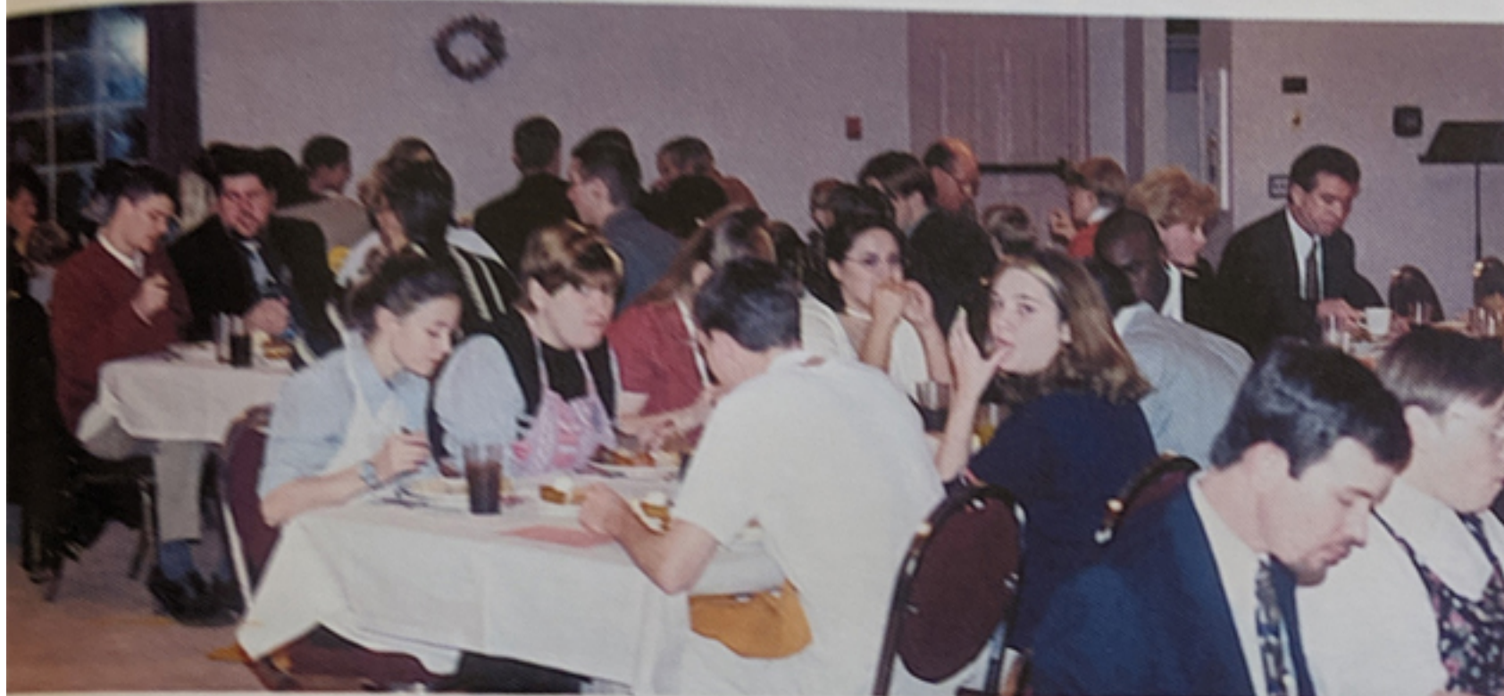
Left: Faculty, staff, and students enjoy a traditional Thanksgiving dinner.