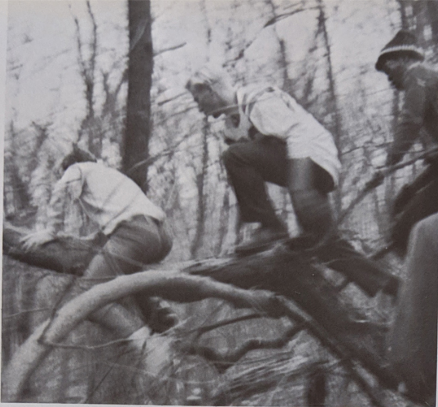
You would think the turkey was chasing THEM!