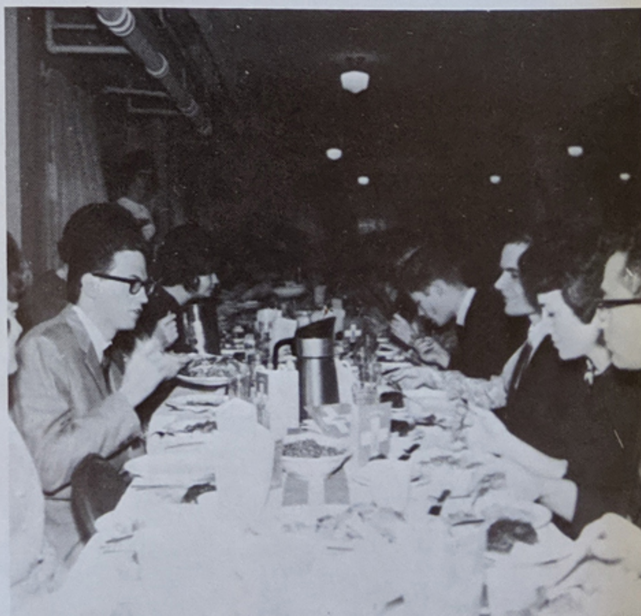
The delicious banquet was enjoyed by all.