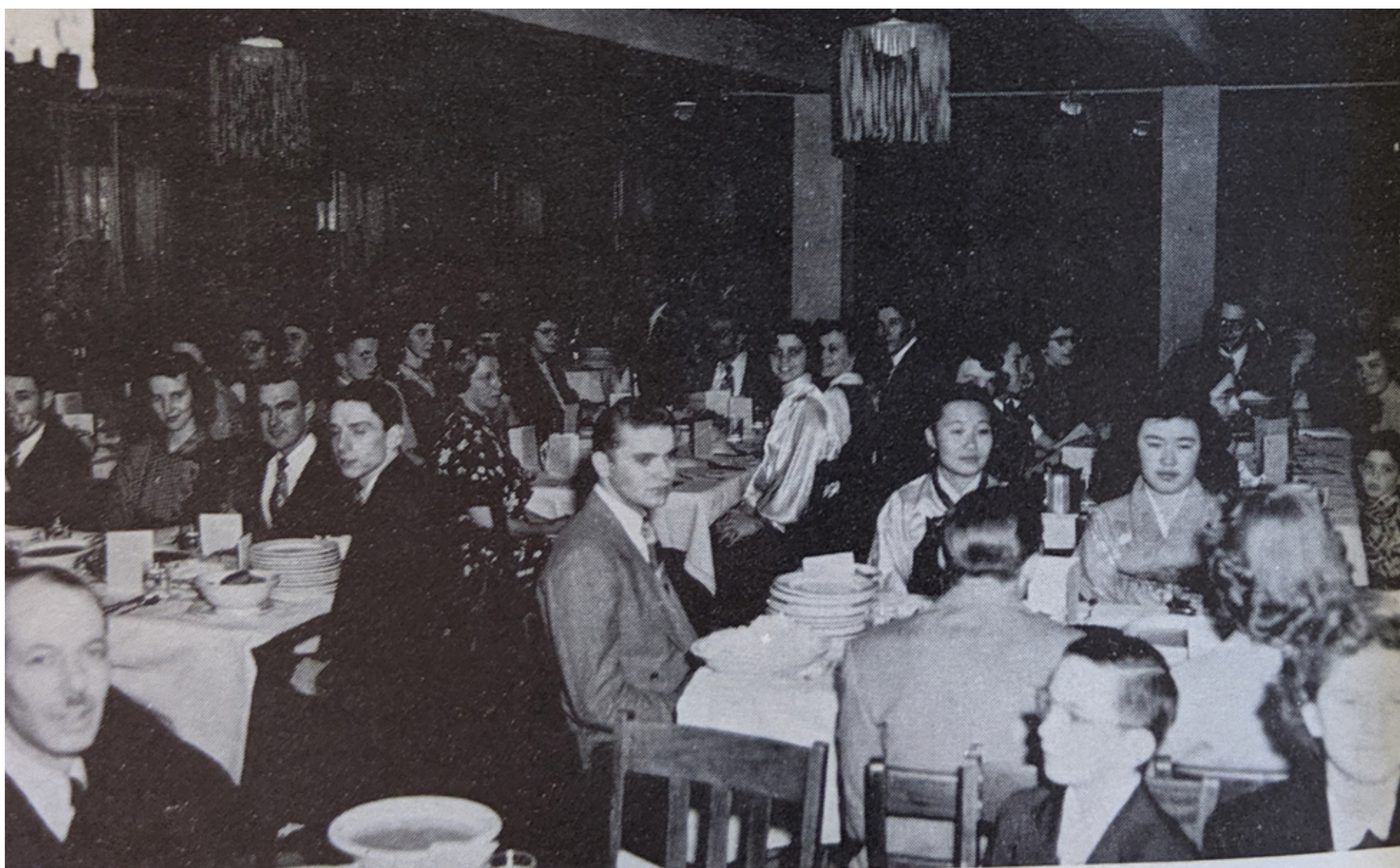
Turkey and all the trimmings!