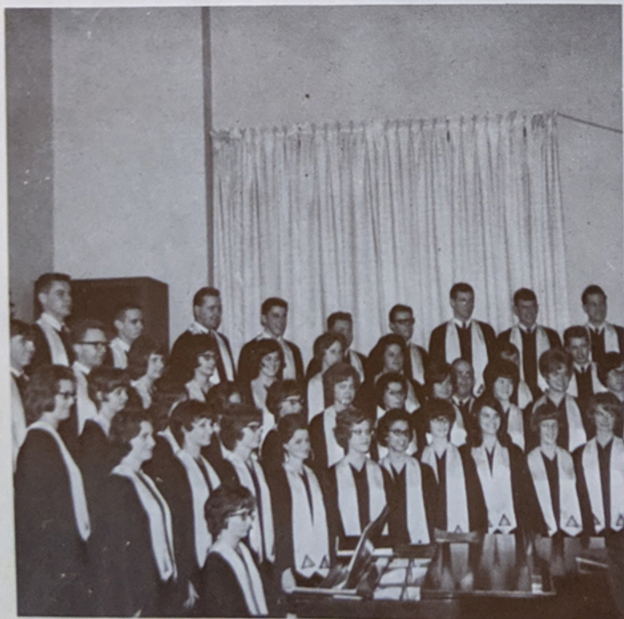
Choir presents concert at the Vesper Service.