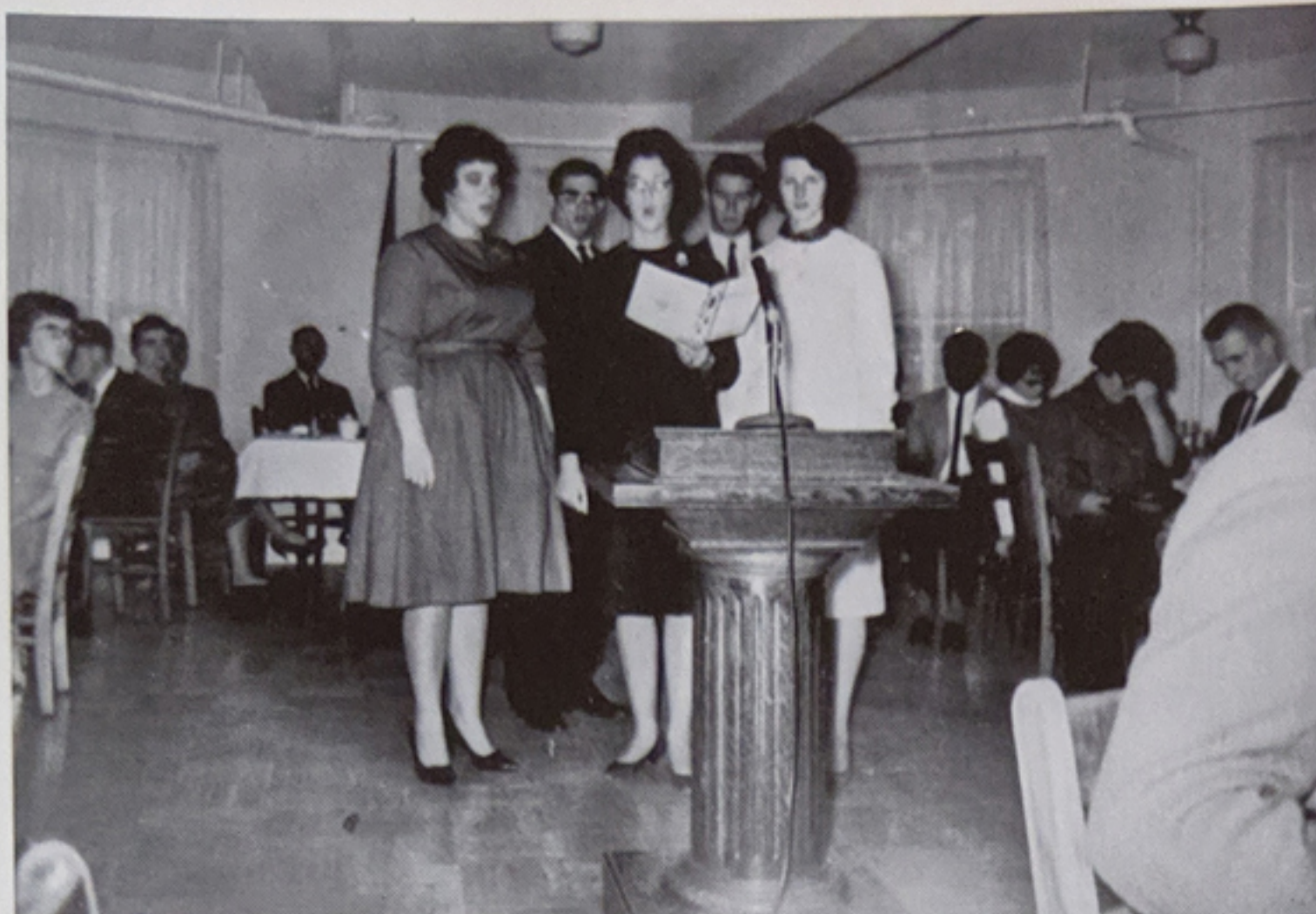
Junior ensemble presents theme song, "This is My Country."