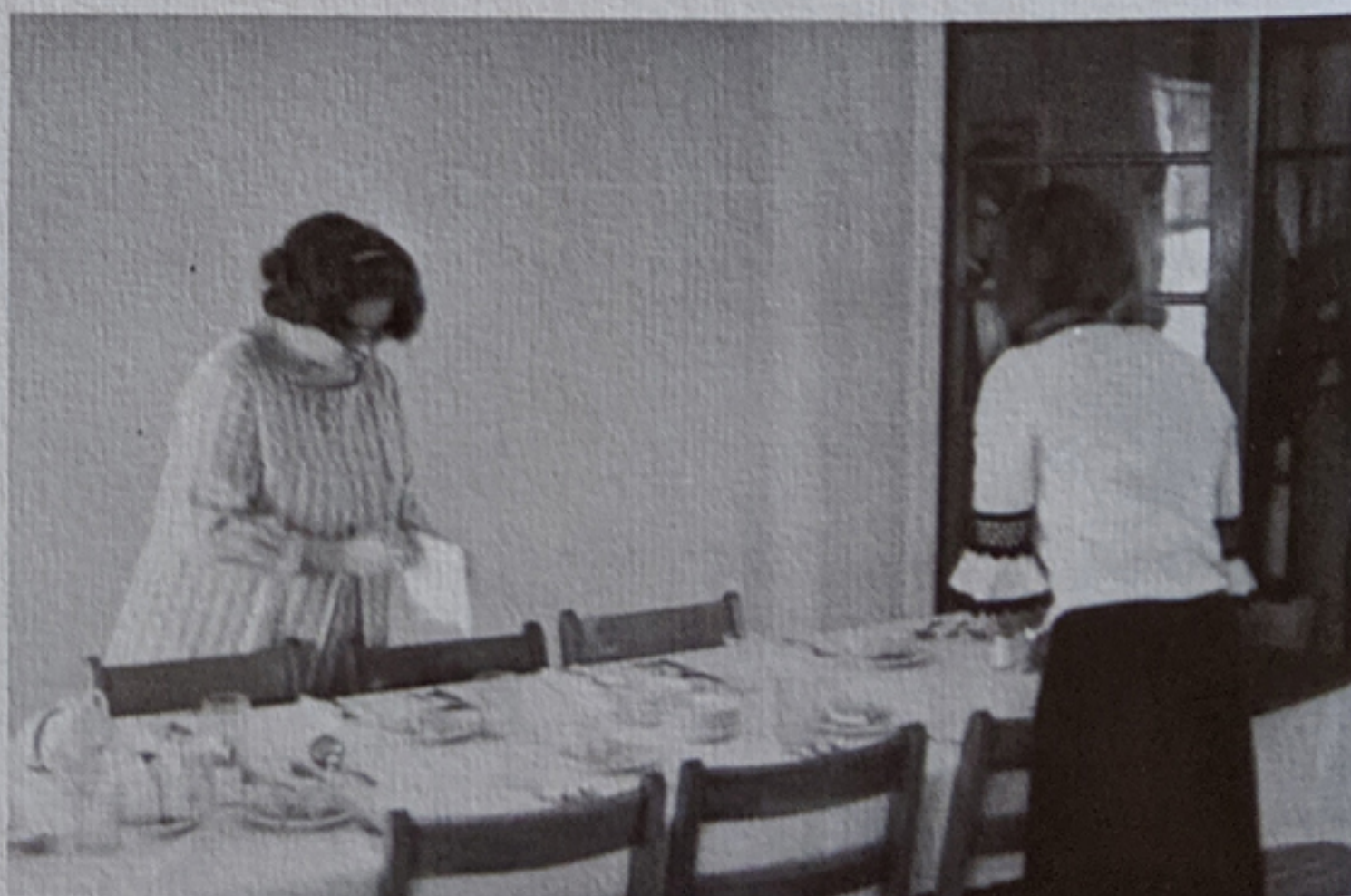
Thanksgiving dinner for friends and relatives.