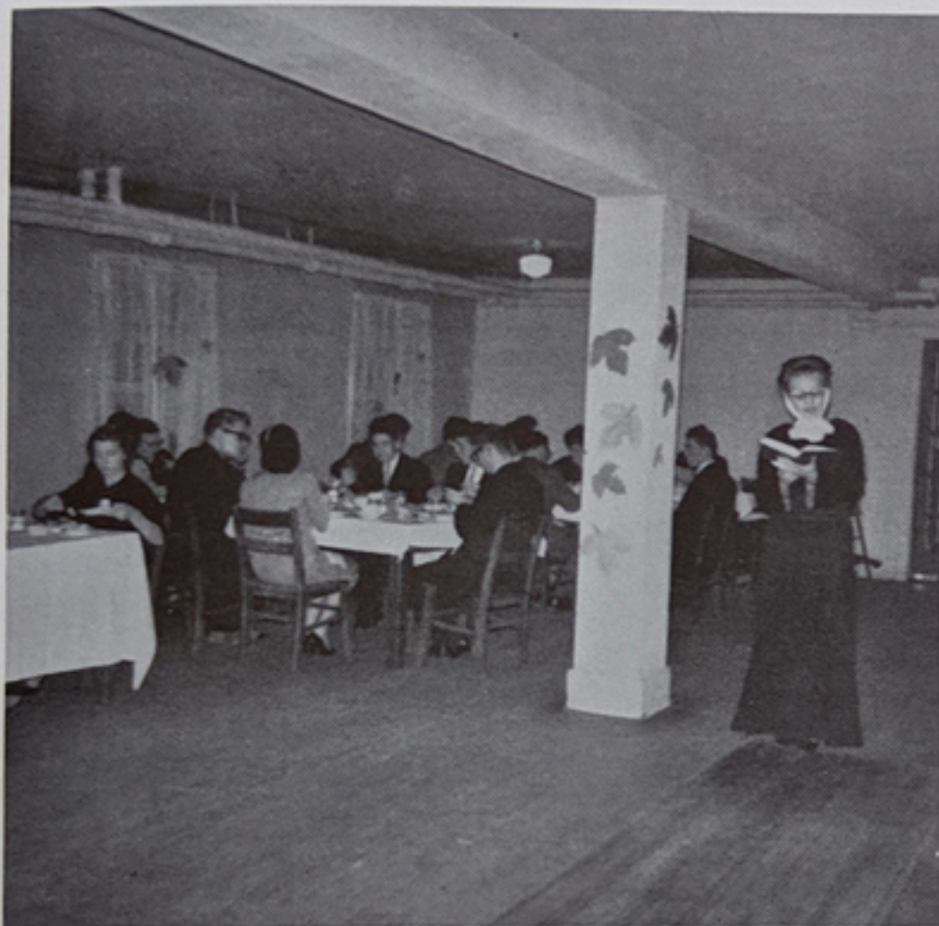
PORTRAITURE OF THANKFULNESS